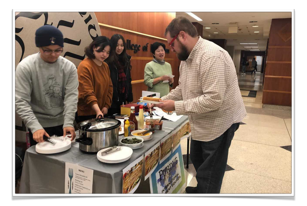
Members of CLAISC help prepare hotdogs for customers with an international twist

The council kicked off the spring semester with a hotdog fundraiser that we called 'interdog' as we combined the authentic American hotdog with international flavors from all over the globe. This event was a huge hit. The customers loved the unconventional pairing. This could be seen by how within the span of only a few hours, the council members at the table had exhausted all of the food items they were using to put together their unique hotdog combinations. The fusion of cuisines was a risk that payed off. It allowed us to witness that the liberal arts community is never afraid of welcoming an amalgamation of cultures even if it is through food. They did not hesitate to try a variety of options from the menu we had created. They also created a few unique 'interdog' combinations of their own. By organizing a fundraiser so early-on in the semester, we were gifting ourselves financial freedom to not compromise on our vision in terms of the types of activities and events we wanted to organize as to serve as an inclusive space for students from all over the globe.