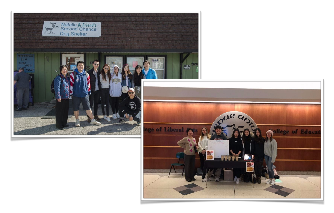
CLAISC members visiting Natalie's Second Chance and at the fundraiser booth

Natalie's Second Chance is a non-profit, no-kill dog shelter located in the heart of Lafayette, Indiana. Our council partnered with this shelter in order to raise funds that would go towards the medical care of two dogs, Lovey and Tucker. Both of these dogs required immediate surgical attention. To effectively raise these funds, we partnered with the bubble tea company, LaTea . The company was generous in its contribution of bubble tea we could sell at the fundraiser. All the proceeds from the bubble tea sale went to Natalie's Second Chance . After the fundraiser, we all went to the shelter to spend quality time with the dogs as well as talk to the managers about how we can further contribute towards their cause. We are committed to helping Natalie's Second Chance and look forward to organising more events in the future that would benefit the shelter in multiple ways, big and small.