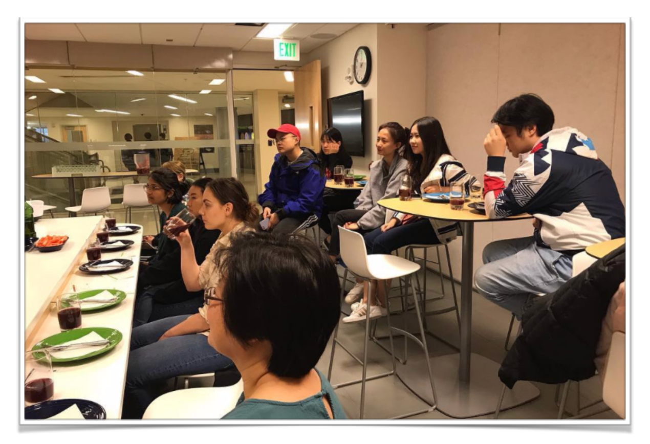
CLAISC members taking part in the Mediterranean style cooking demonstration

The cooking demonstration was a great opportunity for the members of CLAISC to not only send time with one another outside the realm of official meetings, but also bond while doing something fun together. The CLAISC team went to a cooking demonstration that revolved around mediterranean food. Two chefs showed the members how to cook a variety of mediterranean dishes in an effective manner in the comfort of our own homes. The chefs demonstrated the step-by-step process required to make each of the individual dishes. They also taught us some everyday neat tricks to apply in the kitchen. In the end, we were all able to sit together and enjoy our meal. We learned something new while at the same time enjoying the company of our peers. This served as a good, relaxing activity amidst all the stress that accompanies the final few weeks of a semester. It worked as a constructive break for all our members in between all of our hectic schedules and commitments. It also gave us the idea to maybe rent a kitchen and cook for ourselves next time. We look forward to carrying this tradition forward.